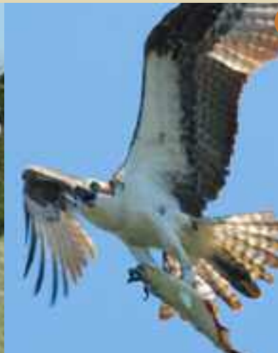
Around Delmarva, birders can see marvelous sights such as this osprey carrying home a meal.