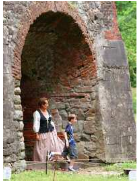
A new course at Wor-Wic offers guidance on making the most of the Shore's many natural and cultural resources, such as Furnace Town Living Heritage Museum.