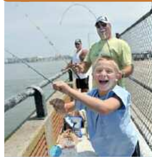
THE BALTIMORE SUN